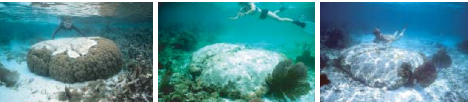
Figure 5. Coral reefs and related organisms throughout the Caribbean and Florida began to succumb to a number of diseases during the late 1970s and took a dramatic turn for the worse in 1983 and 1984. The herbivorous urchin Diadema was attacked by an unknown pathogen, which spread through the Caribbean basin in one year. Its near extinction from the Caribbean ecosystem allowed prolific growth of various benthic algae that compete with corals for space. At the same time two species of framework corals ( Acropora palmata and A. cervicornis) experienced high rates of mortality across the region. A fungal infection attacked the common sea fans, and diseases such as black band and white plague, which attack massive corals, are still causing a decline. Identification of the soil fungus Aspergillus sydowii as the cause of the sea-fan disease and its presence in African dust currently provides the best example of a dust-distributed disease. Many other coral diseases may be spread by African and Asian dust. The death of M. annularis from black-band disease on the Florida reef tract is documented in these photographs taken in 1988 (left), 1998 (middle) and 2001 (right).