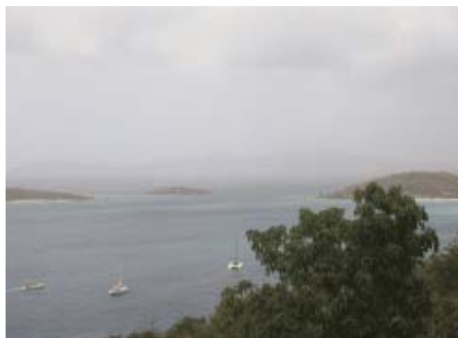
Figure 6. Views of the Caribbean on a clear day (left) and during an African dust event (right) offer a dramatic example of a dust storm's impact many thousands of miles away from its source. Physicians and scientists have detected an increase in the incidence of asthma on the Caribbean island of Barbados since 1973, which coincides with the worsening of the drought in Africa.