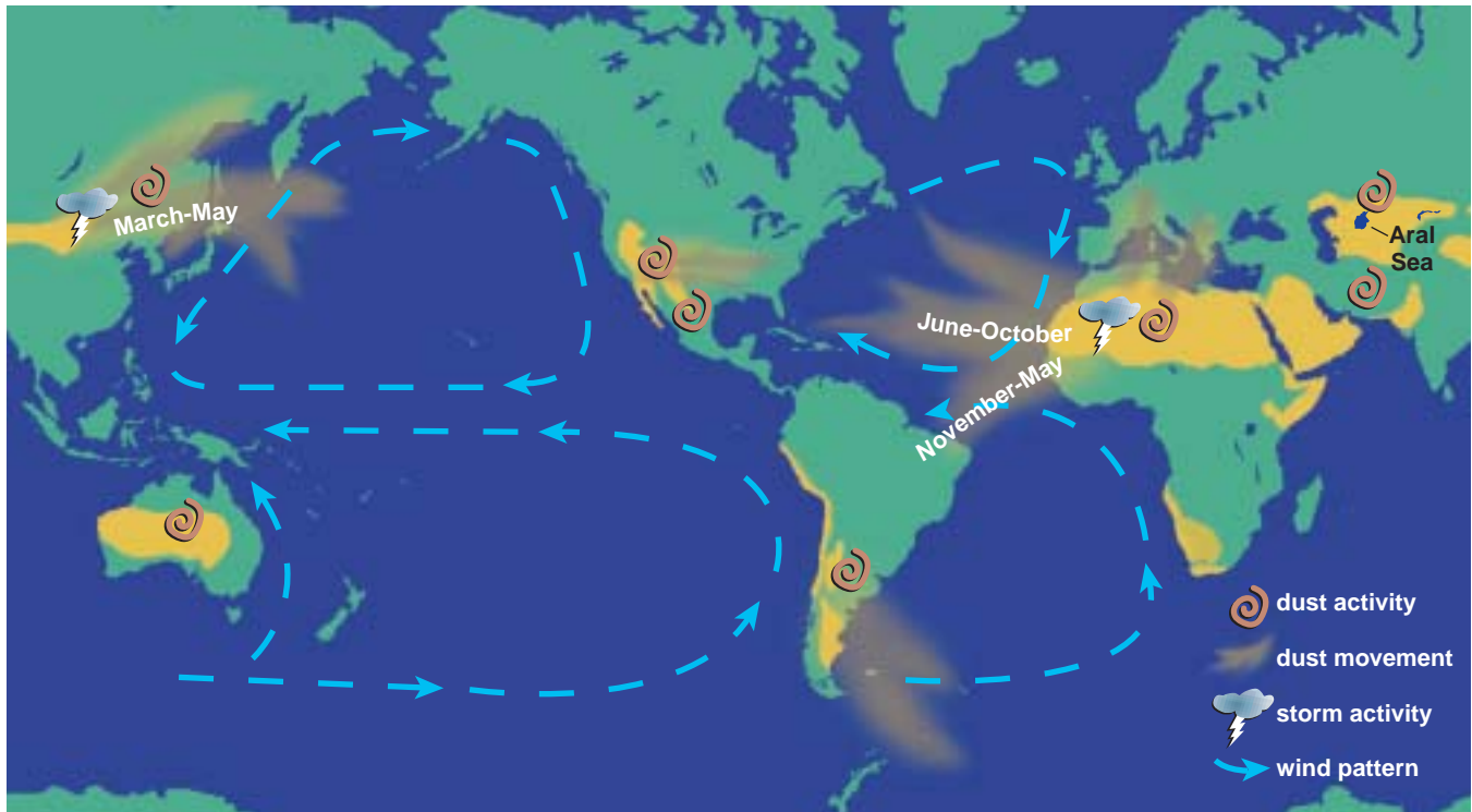
Figure 3. The world's arid regions (yellow) are the primary sources of the dust in the atmosphere. Storm activity over these regions lifts the sediments, which are then carried for thousands of miles across the oceans by the prevailing winds. Dust storms blow off the coast of Africa throughout the year, but they show a seasonal pattern in which the winds carry the sediments farther north for several months. In contrast, storms off the Asian continent tend to occur during spring in the Northern Hemisphere. Droughts and agricultural practices in many regions—such as North Africa, the Gobi Desert and around the Aral Sea—have increased the size of the arid lands and so aggravated the problem in recent decades.

whims of atmospheric circulation patterns, often settling many thousands of kilometers from their site of origin.