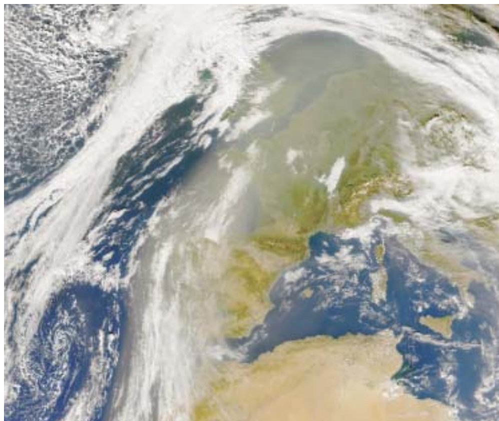
Figure 2. African dust routinely affects the air quality in Europe. This image was made on October 30, 2001.

A process that could transfer enormous numbers of microorganisms into the atmosphere was identified in the late 1990s, when satellite images revealed the astonishing magnitude by which desert soils are aerosolized into giant clouds of dust. The energy for this massive launch into the atmosphere comes from rapidly moving high-pressure systems and storms that produce powerful winds. Once carried aloft, the sediments and their tiny inhabitants are swept along by the