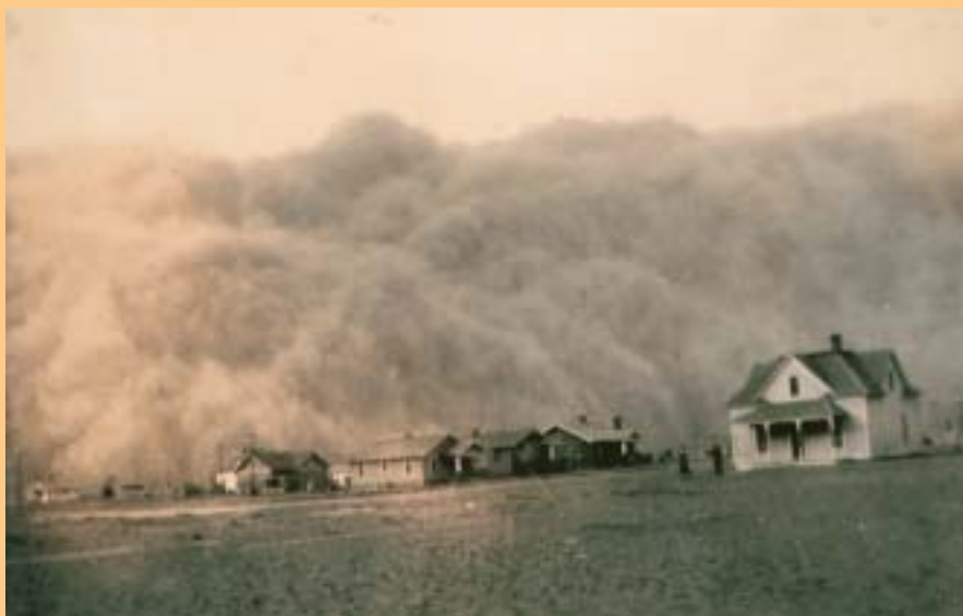
A dust storm approaches Stratford, Texas, in April 1935.