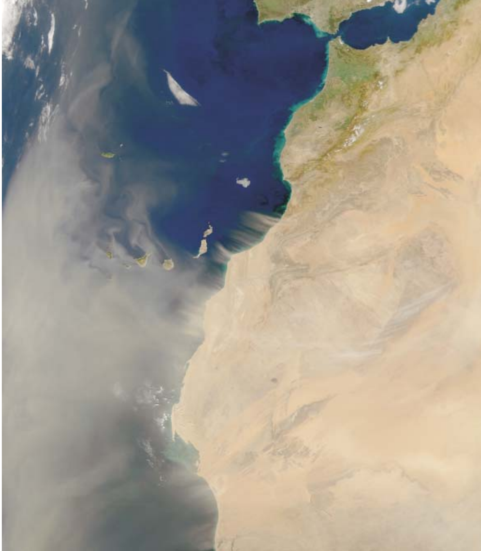
Figure 1. Giant dust storm above northwestern Africa blows out into the Atlantic over the Canary Islands on February 11, 2001. Such dust storms appear to carry infectious microbes and toxic chemicals, and are now believed to pose a significant hazard to ecosystems in the Caribbean and other parts of the Americas. This image was made by the Sea-viewing Wide Field-of-view Sensor (SeaWiFS) on the OrbView-2 satellite, which has observed similar storms every year since its launch in August 1997.