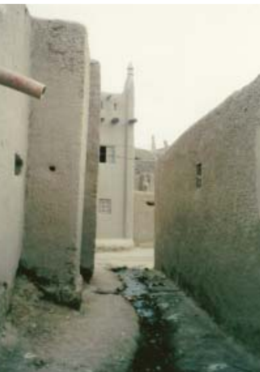
Figure 4. Disposal of sewage in open ditches in communities such as Djenne, Mali, is part of the problem in the arid lands of North Africa. The waste contaminates the surface sediments and adds further to the noxious mix that is carried into the atmosphere.